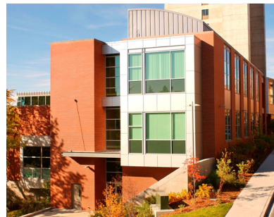
Institute for Shock Physics