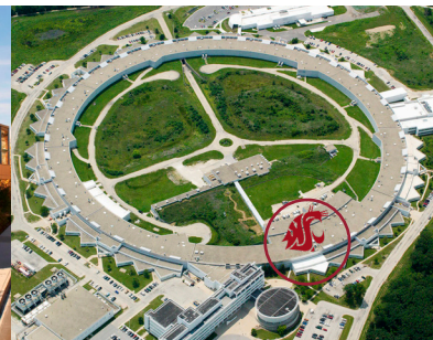
Dynamic Compression Sector